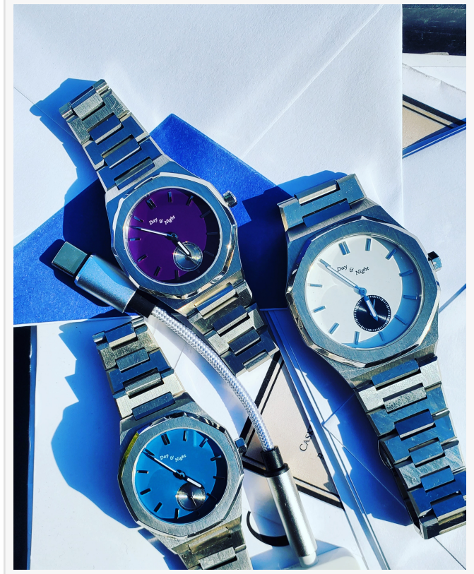
Notable Fashion Favorites at Day & Night Watch Co.

I took some time to think about it. I realized I knew a great deal about <u>watches</u>. I have over 70 different timepieces, and each one went with a