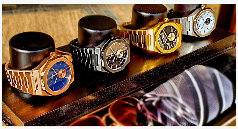
Uncompromising Style at Day & Night Watch Co.

It's been a blessing in so many ways. My goal is to make my brand a motivation for those who want to start their own business. I'm a firm believer in hard work and changing your path to make your life and future generations better.