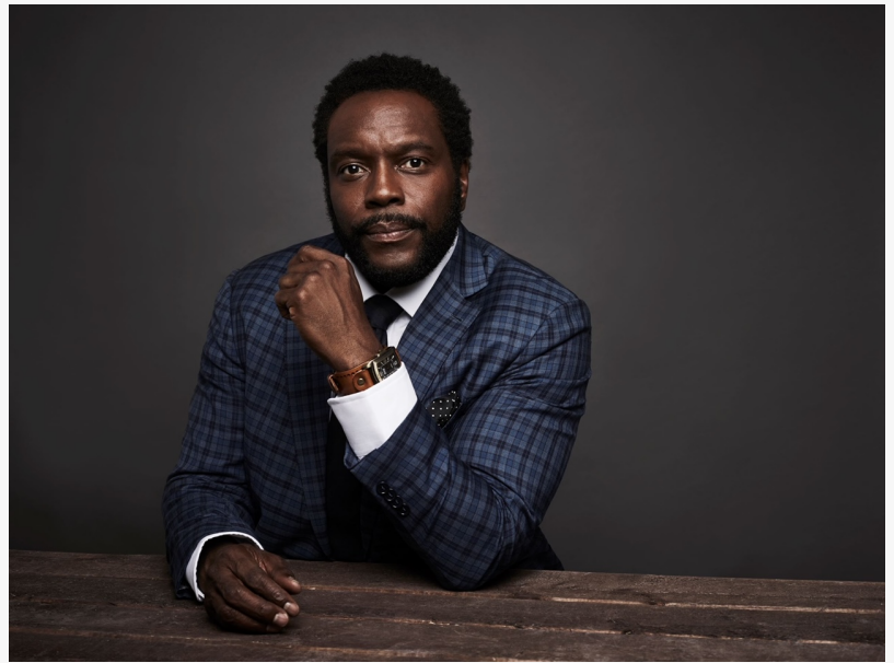
Chad L Coleman

BELLMORE, NEW YORK, UNITED STATES, July 8, 2022 / EINPresswire.com/ -- Actor Chad L. Coleman , widely known and critically acclaimed for his brilliant performances on popular television programs the Emmy award nominated "The Wire" and Golden Globe nominated "The Walking Dead", will be appearing at the 25th Anniversary edition of the Long Island International Film Expo (LIIFE), happening from July 13 - 17th at the historic Bellmore Movies 222 Pettit Ave, Bellmore, NY.