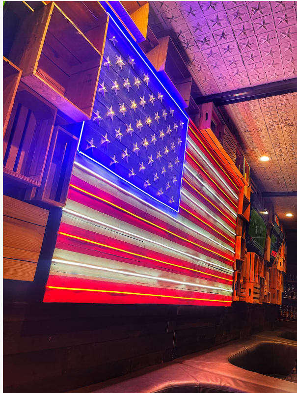
Landmark Bar & Kitchen is coming to Dallas

Landmark offers the best happy hour in the neighborhoods it serves, the Dallas location will feature a free Nacho bar and $4 Titos, Jack, Frozens and Big Beers to wash it all down Monday- Fridays 4-7PM! Landmark prides itself as having “Strokes For All Sort of Folks” and has nightly programming to appeal to everyone in the neighborhood. From Karaoke, Music Bingo, Steak Night ($14.99 Steak and Loaded Potato on Wednesdays), Boozy Brunch and Live music, there is always something going on.