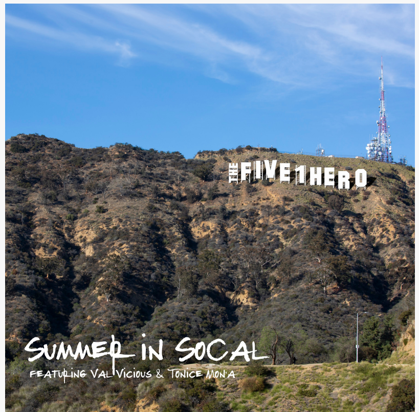
Summer in SoCal releases July 15th 2022

Representative of his production style, you can picture these three live, either at an outdoor music festival or even a small night club or brewery jamming away.