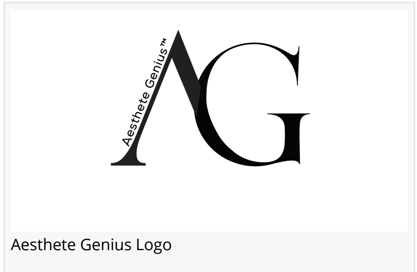
Aesthete Genius Logo

CALGARY, ALBERTA, CANADA, August 1, 2022 /EINPresswire.com/ -- A new app is changing how patients seeking aesthetic treatments choose which procedures to do. Aesthete Genius uses AI technology to show patients and clinicians what the results of various aesthetic injectables and treatments would look like post-treatment. Armed with these illustrations, patients can make more informed decisions about their treatments, while clinics can offer a more interactive consultation process showing patients projected treatment results.