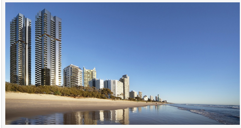
An artist impression of Paradiso Place looking from the beach at Surfers Paradise

"From smart home controls to smart community management and access to lifestyle offerings, the Habitap mobile application customised for Paradiso Place will transform how its residents connect and interact with their built environment and experience the