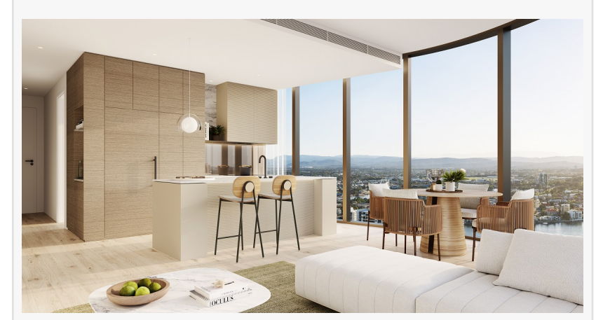
Paradiso Place apartments can be controlled by the latest in smart home technology from Habitap

amenities provided. The Paradiso Place App's open platform connects homeowners to an ecosystem of smart appliances and devices, commonly known as Internet-Of-Things, from wherever they are in the world at any time.