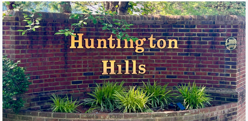
111 Huntington Hills Lane, Fredericksburg, VA 22401

The auction’s date, address and highlights follow below noted Strauss.