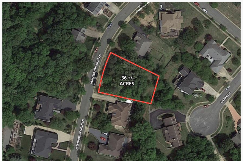
111 Huntington Hills Lane, Fredericksburg, VA 22401