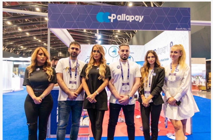
sell usdt in dubai