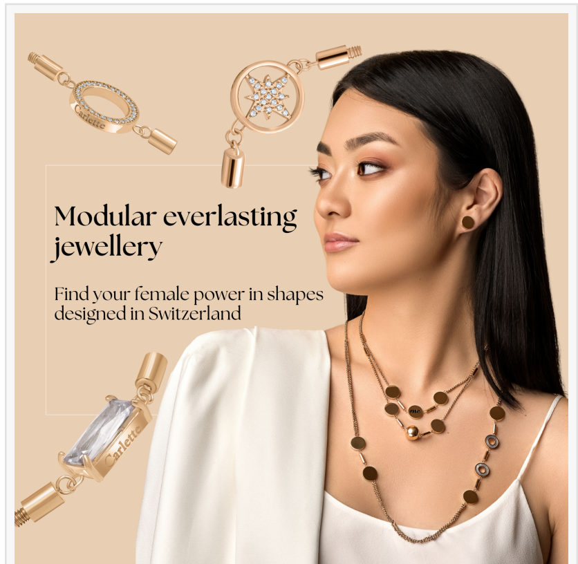
Carlette Jewelry - Modular jewelry

Although the fashion world is changing quickly, this one-of-a-kind innovation has something special. It can be part of the timeless collections through which the owners can expose their style and originality.