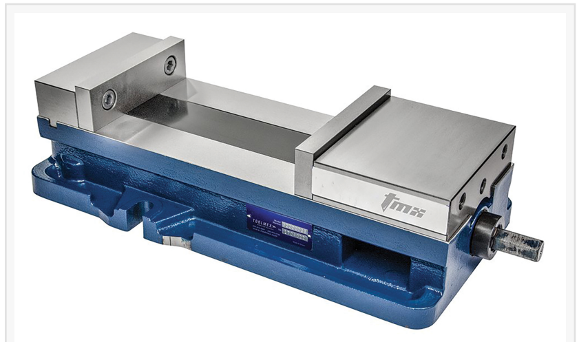
6" Milling Machine Vise by TMX with a 9" jaw opening - a budget conscious alternative to Kurt Anglock vises lets you squeeze your budget

KBC Tools & Machinery has been providing the metalworking industry with the best tools at the best prices since 1965: cutting tools, indexable tooling, fluids, work holding, abrasives, measuring & inspection equipment, toolroom accessories, hand tools, shop supplies, power & air tools, and machinery. KBC is proud to be certified as a WBE company in Canada and a WBENC company in The USA. KBC is one of the leading metal cutting tool and machinery catalogue houses in North America with 3 locations complete with showroom in Canada: Mississauga, ON; Oldcastle, ON; and Delta, BC; and 4 locations in The U.S.A.: Sterling Heights, MI; Sterling Heights, MI Machinery Showroom; Elk Grove Village, IL; and Fullerton, CA; KBC Tools & Machinery – www.kbctools.com -