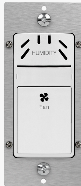
Enerlites Humidity Sensor