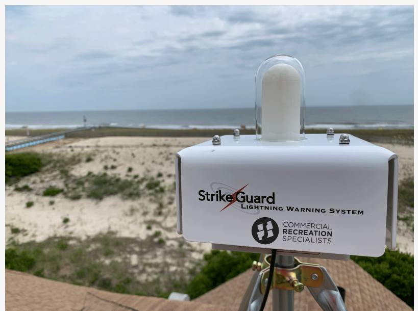
Strike Guard Lightning Warning System, installed by Commercial Recreation Specialists, on rooftop of Jersey Shore lifeguard station

Two nearby towns have also installed the same lightning detection systems at their ocean front