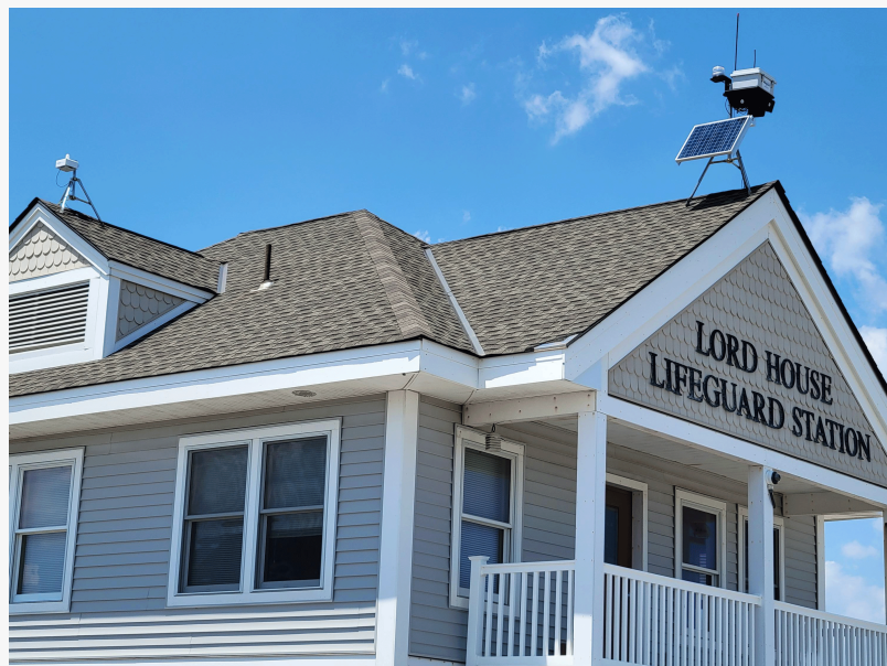
State-of-the-art lightning detection system atop Lord House Lifeguard Station at Jersey Shore

This press release can be viewed online at: https://www.einpresswire.com/article/580795878