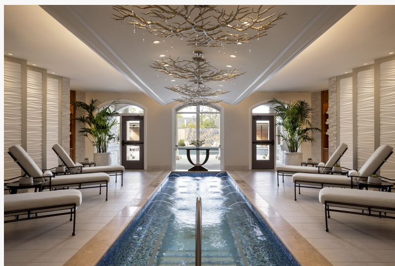
Trellis Spa features a tranquil indoor float pool for resting and relaxing, as well as custom branchlike chandeliers dripping with crystal water drops and outdoor pool views.