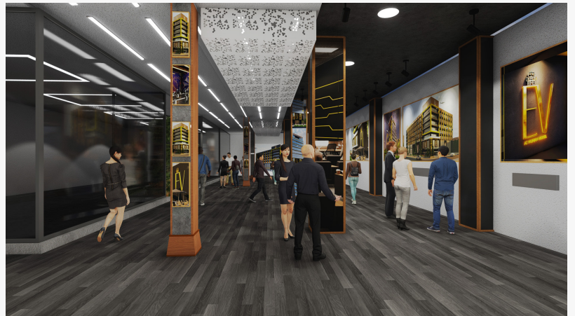
EV Hotel NFT Display