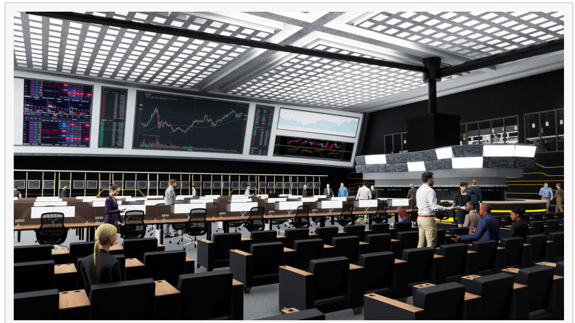
EV Hotel Crypto Trade Floor

devices, like the smart mirror, smart faucet, smart speaker and more, will be available in each guest room, as well as tools to support guests with contactless service options. Alongside the CDX Crypto trading floor, Beverage grab and go, Automation on Room Service, Experience Desk, and NFT lobby will further establish EV's emphasis on technology. I'm drawn to limitless knowing as all there is. Dream of a limitless dream, know your dreams are images unlocking what your