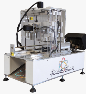
STM Canna Atomic Closer Pre-Roll Closing Machine