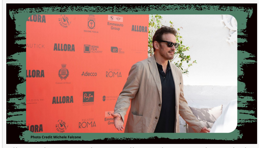
Allora Film Festival Matt Dillon