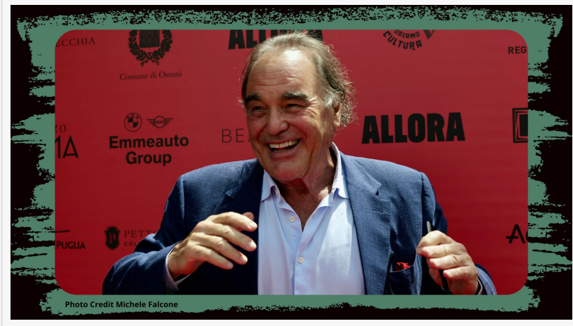
Allora Film Festival Oliver Stone - Photo Credit Michele Falcone

Tombstone Pillow has garnered 33 awards and 43 nominations around the Globe.