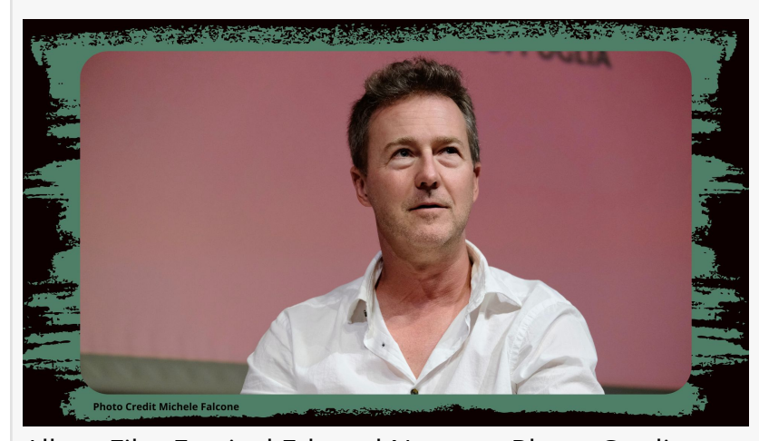
Allora Film Festival Edward Norton