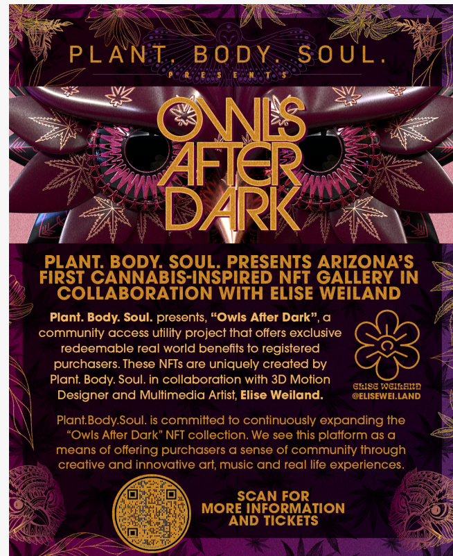
The 'Owls After Dark' launch poster