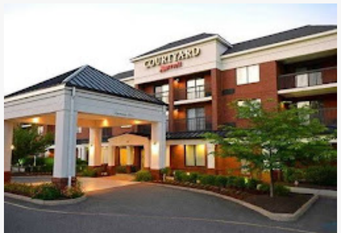
Courtyard by Marriott Newport News Yorktown 105 Cybernetics Way, Yorktown VA 23693

This press release can be viewed online at: https://www.einpresswire.com/article/580944902