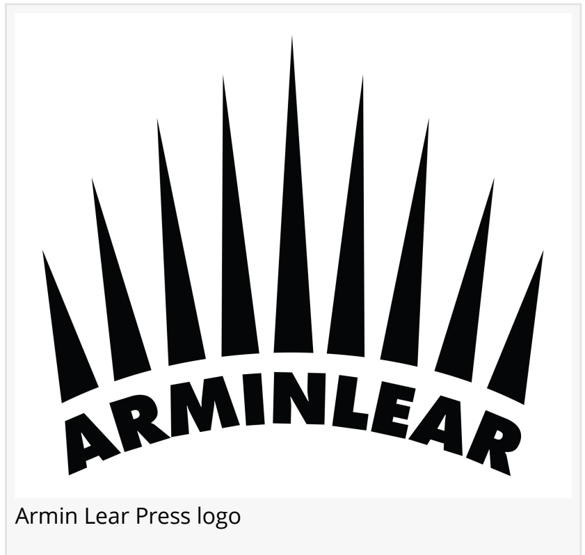
Armin Lear Press logo

This press release can be viewed online at: https://www.einpresswire.com/article/581000000