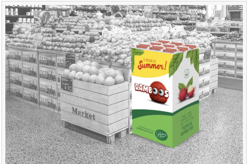
Tropical Rambutan merchandised for grocers by Goldenberry Farms™

Goldenberry Farms™ participates in quality programs such as The Fresh Fruit and Vegetable Program (FFVP), which helps to introduce elementary school children to a variety of produce that they otherwise might not have the opportunity to sample.