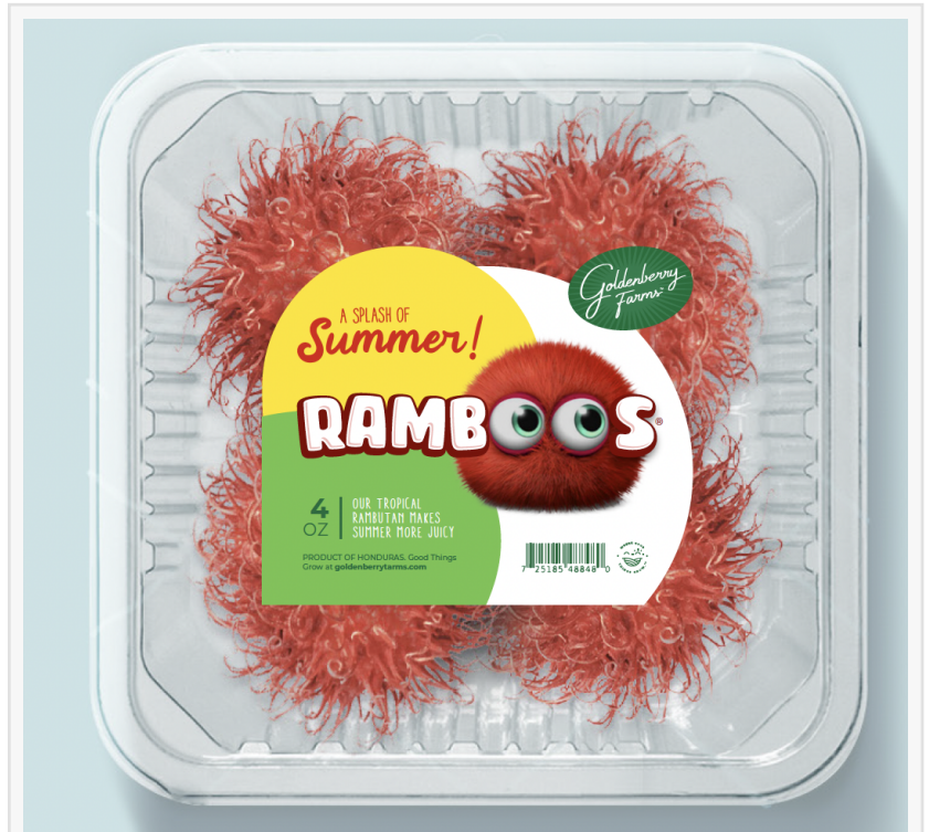
RAMBOOS® branded Tropical Rambutan by Goldenberry Farms are available in 4oz, 12oz, and bulk sizes.

"We are always searching for ways for eating fruit to be more enjoyable and explorative for kids. Ramboos® help to highlight the nutritional benefits of this lesser-known exotic fruit, and help