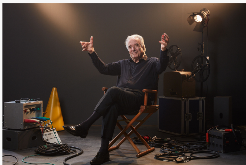
João Carlos Martins

After making his Carnegie Hall debut sponsored by Eleanor Roosevelt in the same year, Martins appeared with major orchestras, played Bach recitals worldwide, and made recordings. The