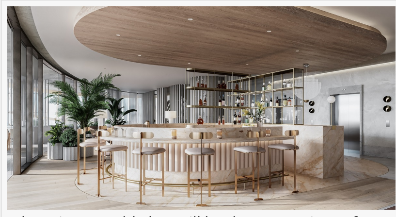
A luxurious marble bar will be the centrepiece of many cocktail parties thrown by Royale Gold Coast's residents in Club Royale

A luxurious marble bar will be the centrepiece of many cocktail parties thrown by Royale's residents, while the oversized cellar room offers 80 chilled individual wine racks and 15 whiskey