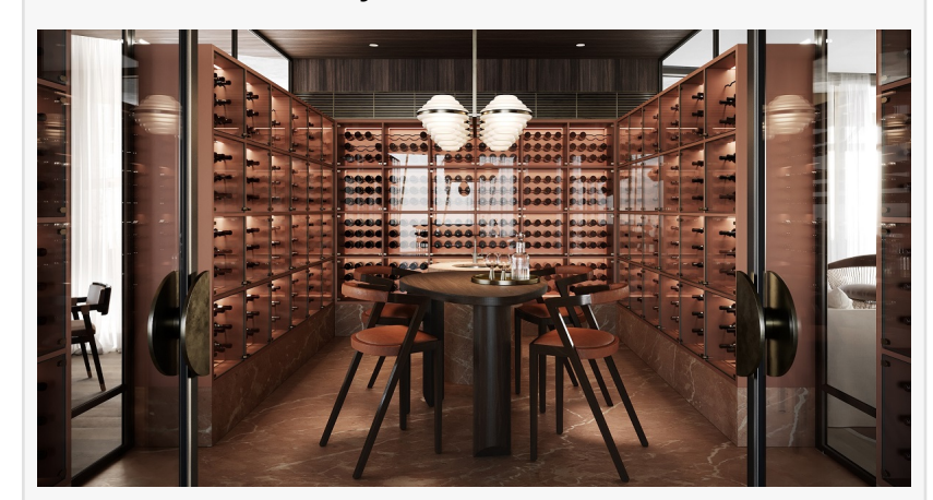
An oversized cellar room in Club Royale offers 80 chilled individual wine racks and 15 whiskey lockers for residents to purchase for the secure storage and display of their fine wines and liquors

lockers for residents to purchase for the secure storage and display of their fine wines and liquors in an intimate setting with elegant furnishings inside the temperature controlled room where connoisseurs can entertain guests.