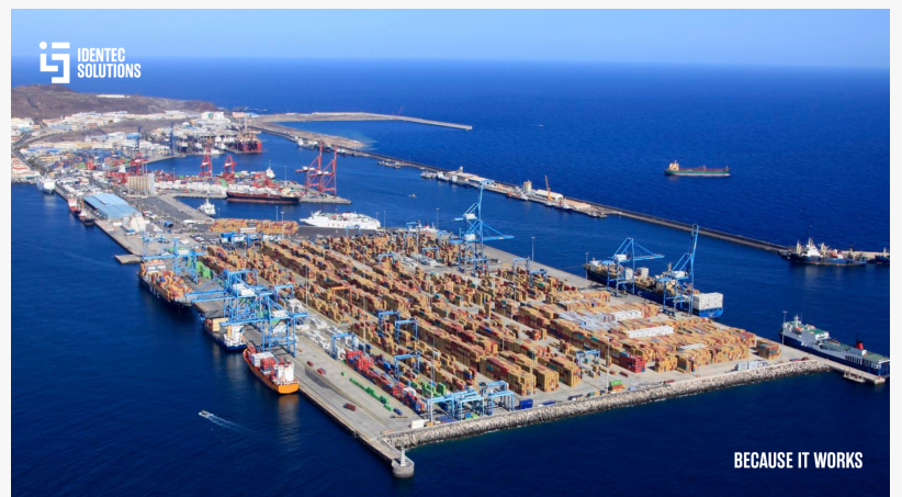
Container Port of Las Palmas OPCSA