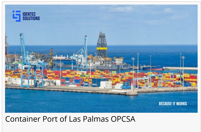
Container Port of Las Palmas OPCS

more than 74 ports worldwide. Because of handling high volumes of containers, it is obvious to use a fully automated solution for reefer monitoring. IDENTEC SOLUTIONS' Reefer Runner application does not only allow real-time tracking of reefer data but also provides a seamless interface to the OPCS TOS (Navis N4) with effortless alarm handling and custom reports based on any data available. In addition, eliminating manual monitoring steps from the process increases efficiency and reduces human error.