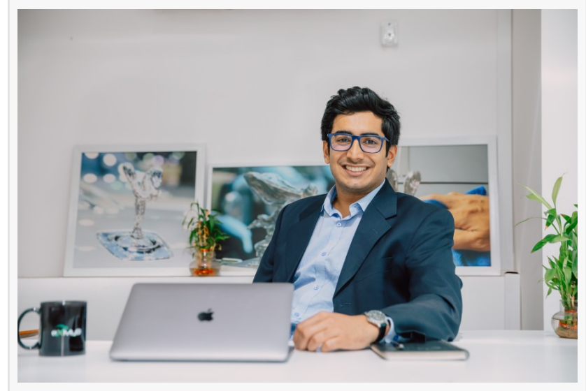
Founder and CEO of Expand My Business

<u>Marketing Services</u>, and <u>Blockchain Development</u> amongst others. The hiring is concentrated on further expanding and optimising Project Delivery, Technology, Marketing and Sales to enhance existing operations and capacity. The firm is also planning to hire for C-suite leaders and senior-level talent in India, and are already in talks with seasoned leaders from other fast-growing startups.