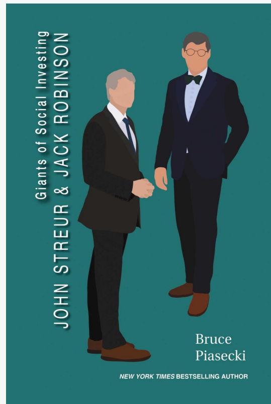
Giants of Social Investing