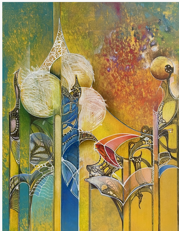
The Pending Victory is a statement of today's world.