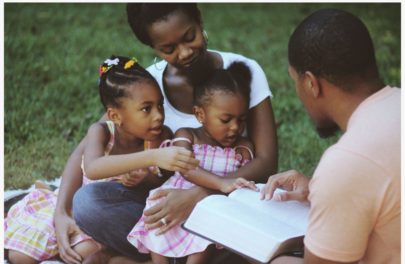
Black Families Need BES