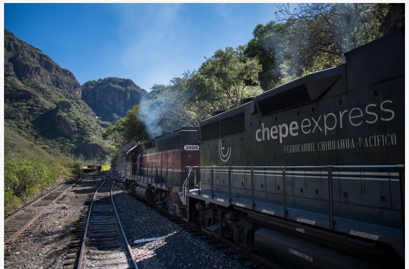
The train to Copper Canyon

All Copper Canyon tours provided by Hoteles include the necessary tickets for the Chepe Express: the train on which visitors can enjoy some of the best views of the green-tinged gorges