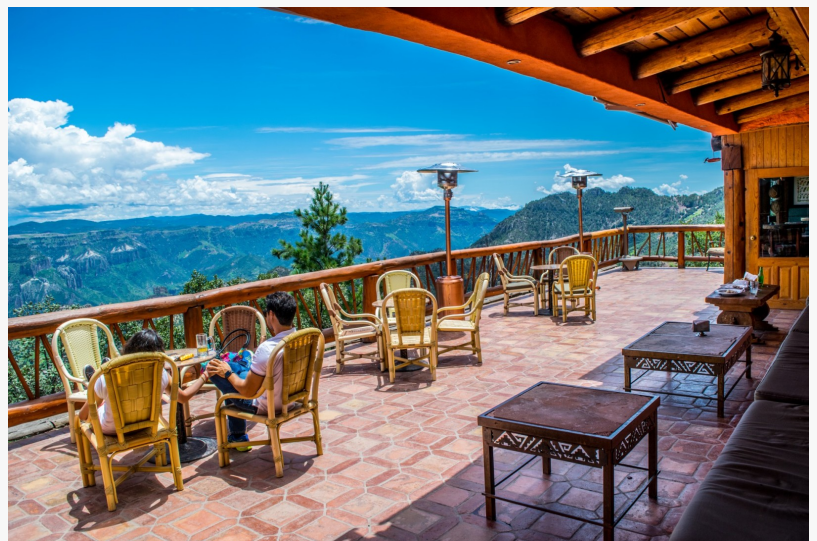
Breakfast at the Hotel Mirador

This press release can be viewed online at: https://www.einpresswire.com/article/581334265