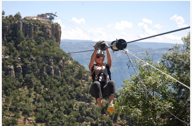
Copper Canyon Adventure Park