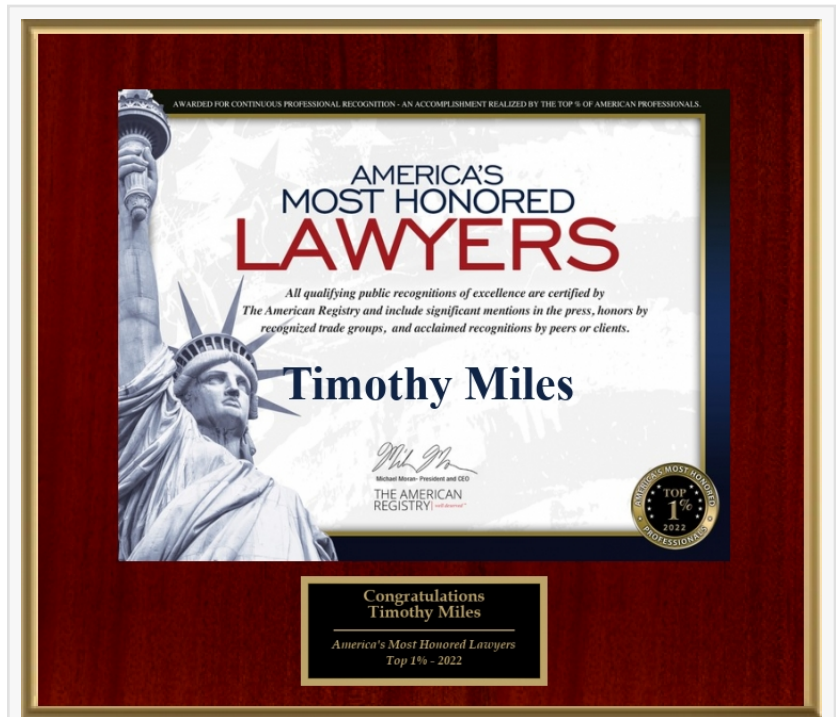
Nationally Recognized Shareholder Rights Attorney Timothy L. Miles

restraining order which stated the following pertinent details regarding the Cumberland facility: "Over 300 beagle puppies have died onsite due to 'unknown causes' over seven months;" "[n]ursing female beagles were denied food, and so they (and their litters) were unable to get adequate nutrition;" "[o]ver an eight-week period, 25 beagle puppies died from cold exposure;" "[p]erhaps the most heinous discovery of the November 2021 inspection was that Envigo had allowed staff to euthanize dogs without anesthesia, in violation of the facility's own program of care;" and "[t]he Government contends that Envigo has consistently failed, despite repeated warnings and opportunities for correction, to meet its obligations under AWA's implementing regulations to provide adequate veterinary care . . . [b]ased on the overwhelming evidence produced by the Government, the Court agrees." On this news, Inotiv's share price fell by