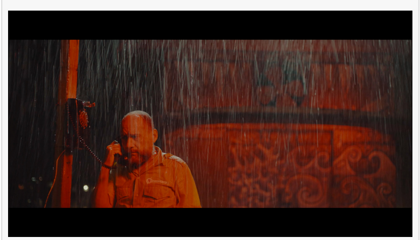
Scene from Tundra