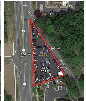
24 Derrick Lane, Stafford, VA 22554, US