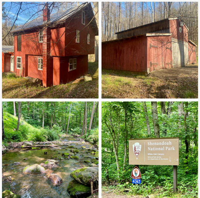
201 Chad Berry Lane, Syria, VA 22743

• This home measures 2,839 +/- total sf. (1,925 +/- sf. of living space & 914 +/- sf. basement) and features an eat-in kitchen, living room w/fireplace, dining room, unfinished walk-out