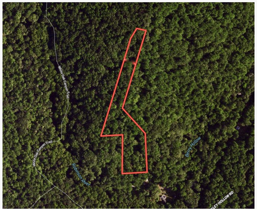
201 Chad Berry Lane, Syria, VA 22743

About Nicholls Auction Marketing Group, Inc.