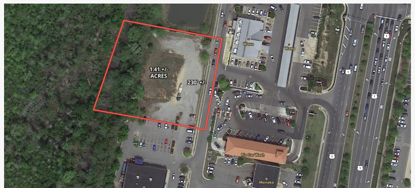
10070 Patriot Highway, Fredericksburg, VA 22407

The auction’s date, address and highlights follow below noted Strauss.