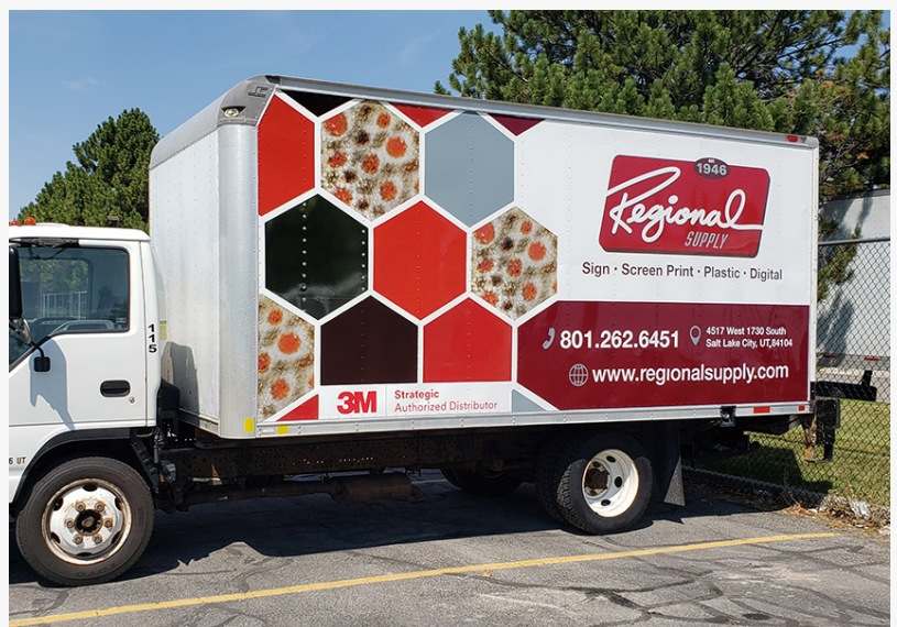
Regional Supply dispatches 12-14 trucks averaging a total of 140 stops everyday.