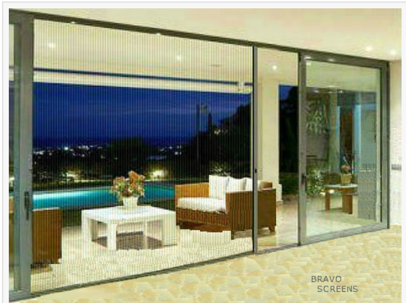
retractable large screen

traditional screens. Our vast selection of screens can significantly enhance the outdoor area and