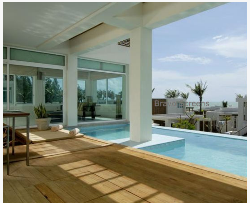
Large motorized retractable screen