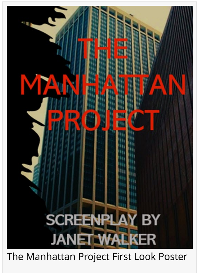
The Manhattan Project First Look Poster

Official Selection - Toronto International Women Film Festival.