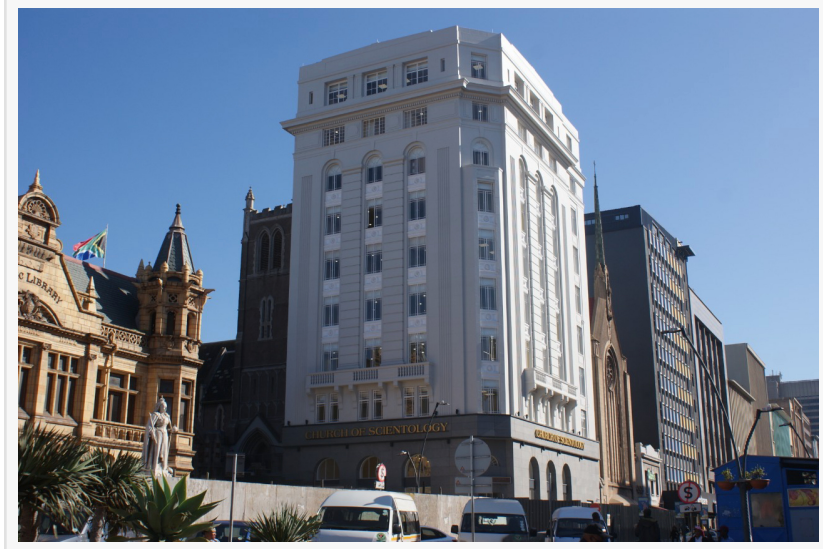
Construction of the New Church of Scientology right across from the City Hall

Sandile Hlayisi Church of Scientology South Africa +27 61 907 9325 email us here Visit us on social media: Facebook Twitter Other