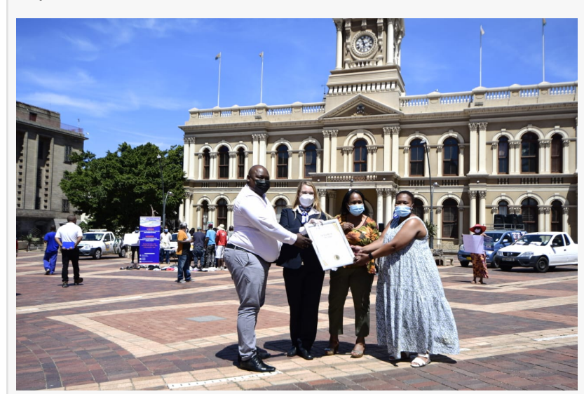
The Mayor and her MMC's standing outside City Hall to celebrate the award

The representative of the Church of Scientology also commented on a new Church of Scientology being constructed right across from the city hall. In her words, the new Church of Scientology of Eastern Cape will assist the community in tackling illiteracy, decreasing drug abuse, increasing drug awareness, moral regeneration, Human Rights education, and more with their free community educational programs.