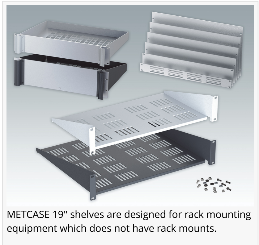
METCASE 19" shelves are designed for rack mounting equipment which does not have rack mounts.

Slots in the bottom of the C4 mild steel shelves aid in-rack ventilation. The shelves are finished in tough powder polyester paint in either anthracite (RAL 7016) or light gray (RAL 7035) as standard. There are two standard sizes – 3.47" x 19.00" x 11.02" and 3.47" x 19.00" x 15.74" – with custom sizes available on request.