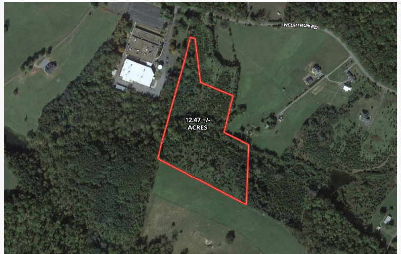
623 Welsh Run Rd., Ruckersville, VA 22968