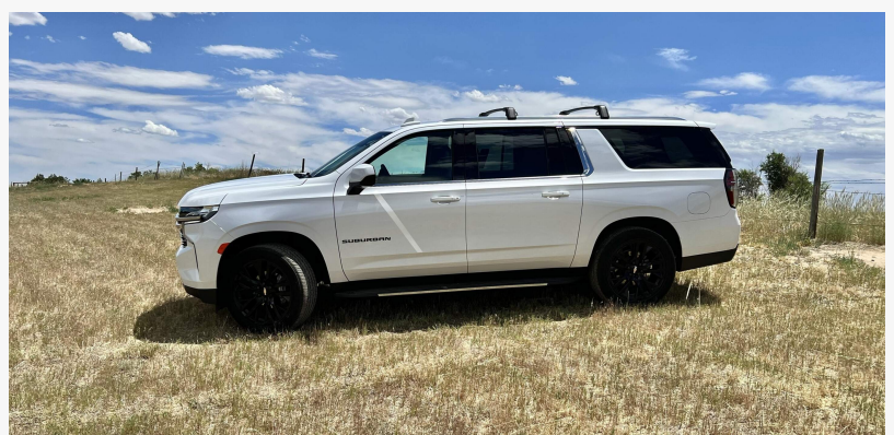
2021 Diesel Suburban Rental