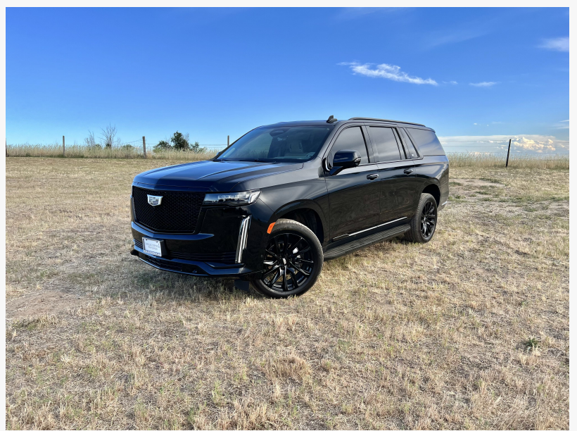
2021 Escalade ESV For Rent

DENVER, CO, BOULDER, July 18, 2022 /EINPresswire.com/ -- Denver, CO: L.P. Transportation today announced their acquisition of two new SUVs to their fleet of Denver SUV Rentals . A 2021 Cadillac Escalade ESV and a 2021 Chevy Suburban join the growing fleet of rental cars offered by LP Transportation.