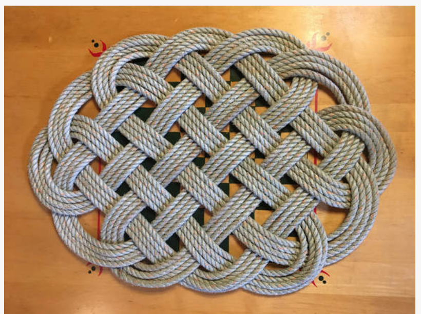
Chafing mat woven by Greg Neitzel.

Description: Led by one of the region's preeminent pine needle weavers, Charlene Virts, students will learn the basics of coiled basketry using pine needles — starting with the selection, cleaning, sorting and dyeing of the needles. Each student will start a basket using a simple wooden center, learn four coiling stitches, and how to add beads. During the class, Virts will share her collection of coiled baskets from around the world.