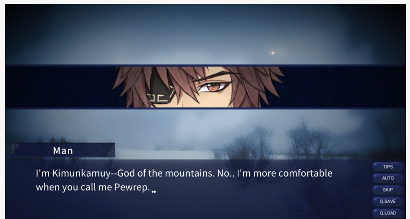
Gameplay Image 1