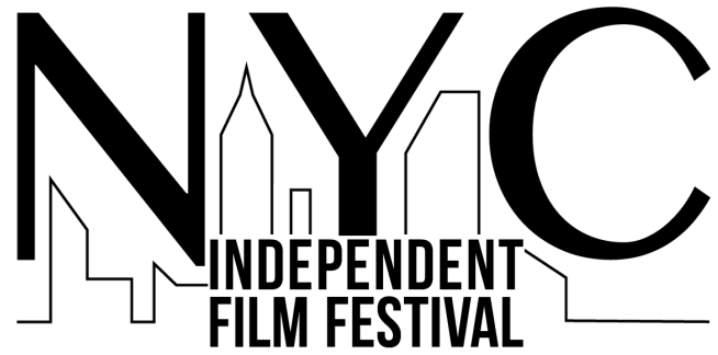
Logo NYC Independent Film Festival