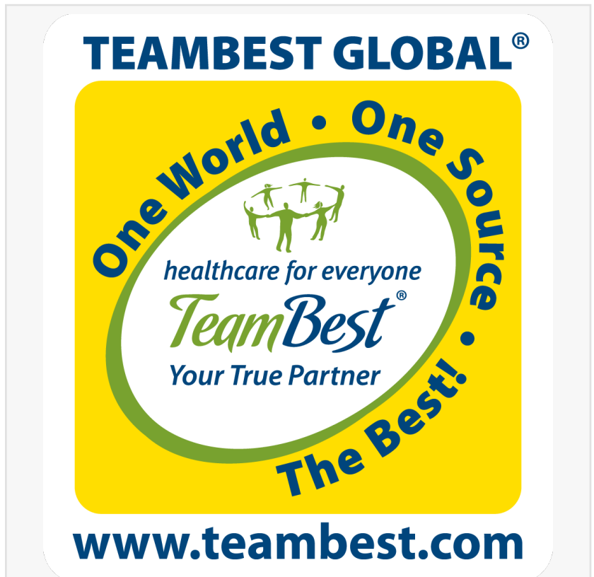
TeamBest Global Companies logo — www.teambest.com