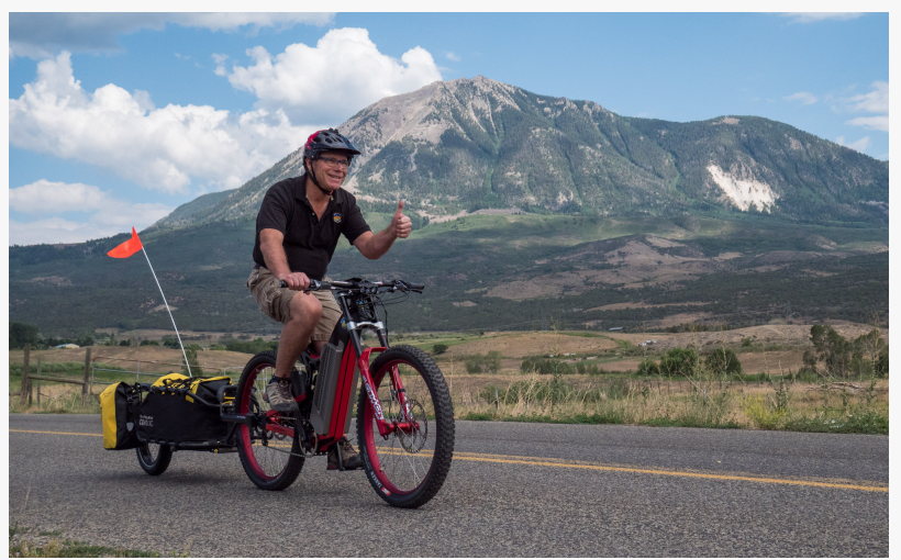
R22 Everest with trailer, ready for exploring