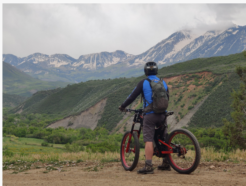
R22 in Mountains

This press release can be viewed online at: https://www.einpresswire.com/article/582050601