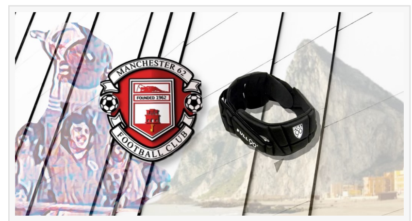
Manchester 62 F.C. to wear protective headgear for concussion safety.

Wonder Lab Films Wonder Lab Films email us here Visit us on social media: