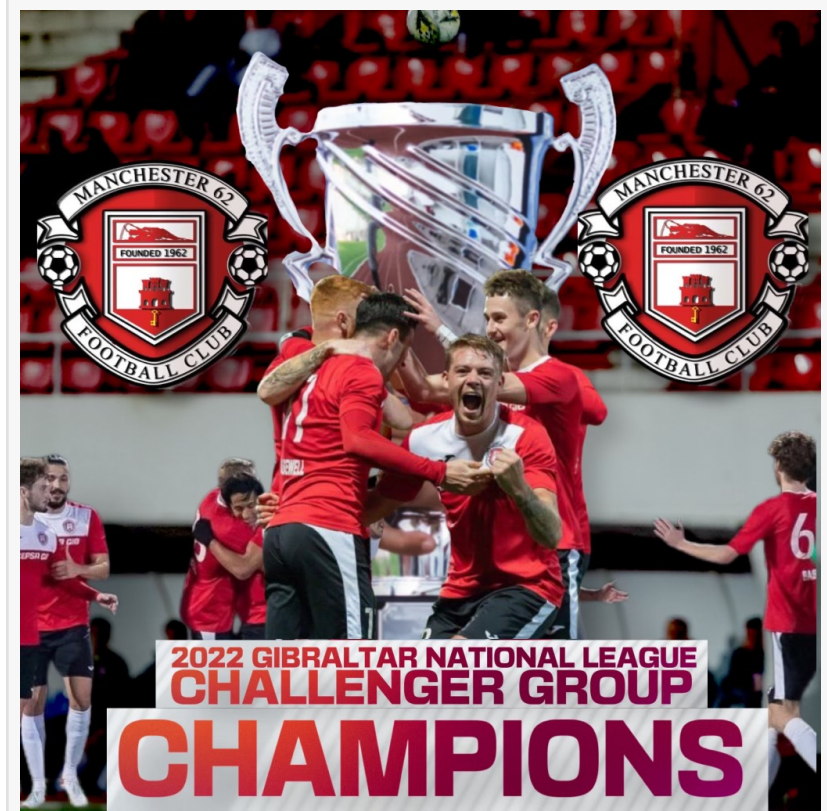
2022 Gibraltar National League Challenger Group Champions, Manchester 62 F.C.