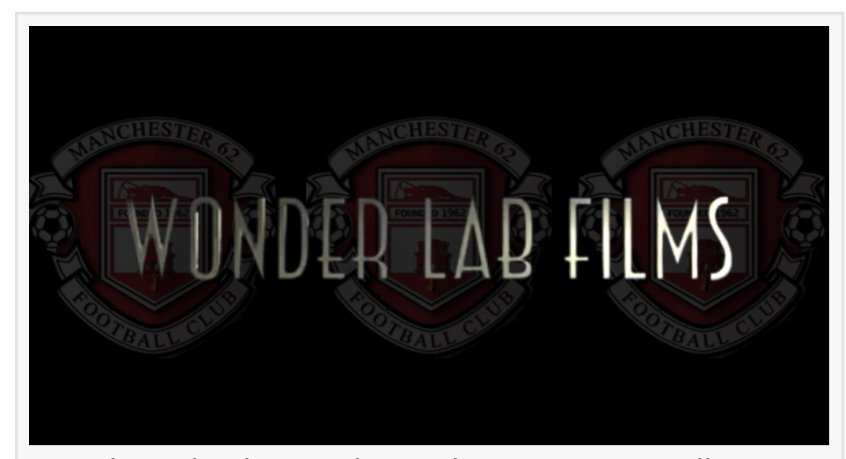
Wonder Lab Films and Manchester 62 F.C. Will Capture History in New Documentary Series

PITTSBURGH, PENNSYLVANIA, UNITED STATES, July 19, 2022 /EINPresswire.com/ -- Wonder Lab films, an independent production company out of Pittsburgh, Pennsylvania with award winning documentary film credits including "Good Morning, Good Morning" and "Democracy Road" will produce a