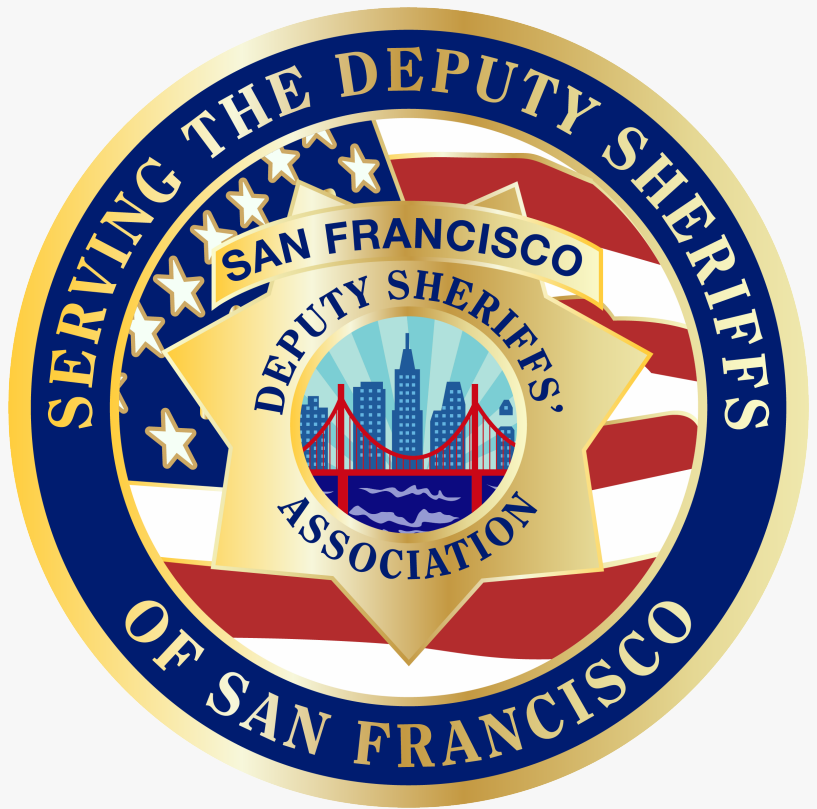
San Francisco Deputy Sheriffs' Association

Exhibit A - staffing report for June 2022 (606 deputies, 23 senior deputies = 629, and 71 sergeants) versus July 2019 (712 sheriff's deputies and 49 senior deputies = 759, and 57 sergeants). This shows more expensive officers increase at the expense of the line deputies who do the work.