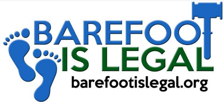
Barefoot Is Legal logo