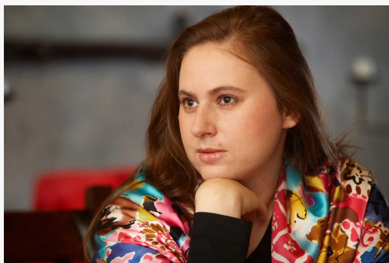
Judit Polgar, Hungarian chess grandmaster.