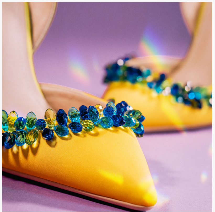
GIA in a shade of bright yellow with blue and green crystals

SUVERIA Communications Team SUVERIA info@suveria.com